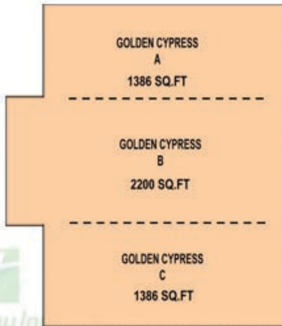
GOLDEN CYPRESS BALL ROOM 4384 SQ.FT