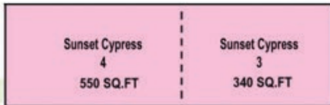
SUNSET CYPRESS MEETING ROOM 890 SQ.FT